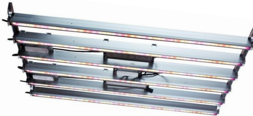
Maximum Current per Luminaire